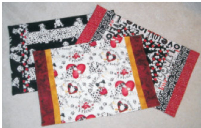
Orphan Block Kennel Quilt 12" x 18"

Quilt in a simple pattern to keep the batting in place.