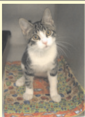
Pretty Girl is an HSPPR adoptee on her Kennel Quilt during the 2012 Colorado fires.

The readers of TQPM responded with over 100 quilts sent from the USA, Canada and England. As a result of the overwhelming response, TQPM and Petfinder Foundation formed the TQPM Small Kennel Quilt Team .